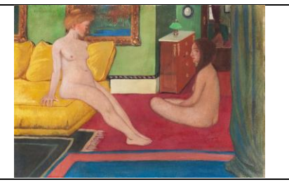
Félix Vallotton Intérieur au divan jaune – Femmes nues dans un intérieur, c. 1897 Tempera/Pastel on canvas, 38 x 55 cm Estimate CHF 600'000.-

The Contemporary Art category was further expanded. Two paintings by Nicolas de Staël, one is the 1952 masterpiece "Honfleur" with an estimate of CHF 800,000.-, lead the group. There are also works by Jésus Raphael Soto, "Doble cuadro virtual" (estimate CHF 250'000.-); a painting by Luc Tuymans from 1991 (estimate CHF 125'000.-) or Günther Uecker's "Splitter für Polen" (1982) with an estimate of CHF 125'000.-. 36 works alone are by Sam Francis, led by five important watercolors from the years 1955 to 1978.