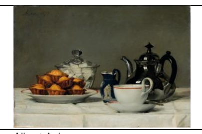
Albert Anker Stillleben: Tee und Schmelzbrötchen – auch Teegedeck, 1873 Oil on canvas, 33 x 48 cm Estimate CHF 1'000'000.-

Three important oil paintings by Albert Anker will come to the block in the Swiss Art category: One of his rare still lifes, "Stillleben: Tee und Schmelzbrötchen - auch Teegedeck" of 1873 (estimate CHF 1 million); probably the most beautiful of the artist's four known cat pictures, "Mädchen mit Katze spielend" of 1887 (also estimate CHF 1 million); and a landscape of Lake Neuchâtel, "Das Bad in Crêt" of 1888 (estimate CHF 800'000.-). Félix Vallotton's "Intérieur au divan jaune - Femmes nues dans un intérieur" of 1897 is certainly one of the most fascinating works from his Nabis period. Works by Cuno Amiet, Adolf Dietrich, Augusto and Giovanni Giacometti, Ferdinand Hodler or Gottardo Segantini round out the offerings.