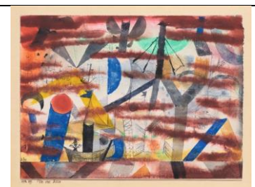
Paul Klee Plan einer Reise, 1918 Watercolor on Ingres with chalk priming, 19.7 x 24.5 cm Estimate CHF 600'000.-

In the Bauhaus year 2019 important works by two of its masters, Wassily Kandinsky and Paul Klee, were entrusted to us in the Modern Art category. Kandinsky's oil painting "Spalte / Fissure" (estimate CHF 1.5 million) of 1926 is flanked by two gouaches and several important graphic works by the artist. A total of 13 original and three graphic works by Paul Klee will come to the block. "Plan einer Reise" (estimate CHF 600,000.-) of 1918 or the large-format watercolor "Haeusliches Requiem" of 1923, incredibly fresh in colors, are noteworthy.