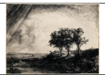
Rembrandt Harmensz. van Rijn Die Landschaft mit den drei Bäumen, 1643 Etching, copper engraving und drypoint, 21.3 x 27.9 cm Estimate CHF 250'000.-

Our catalogs will be available from May 10, 2019; from this point on they can also be accessed online on our homepage www.kornfeld.ch.