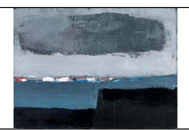
Nicolas de Staël Honfleur, 1952 Oil on canvas, 60 x 81 cm Estimate CHF 800'000.-

The Contemporary Art category was further expanded. Two paintings by Nicolas de Staël, one is the 1952 masterpiece "Honfleur" with an estimate of CHF 800,000.-, lead the group. There are also works by Jésus Raphael Soto, "Doble cuadro virtual" (estimate CHF 250'000.-); a painting by Luc Tuymans from 1991 (estimate CHF 125'000.-) or Günther Uecker's "Splitter für Polen" (1982) with an estimate of CHF 125'000.-. 36 works alone are by Sam Francis, led by five important watercolors from the years 1955 to 1978.