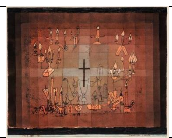
Paul Klee Haeusliches Requiem, 1923 Oil transfer drawing, pencil and watercolor, 32.4 x 39.8 cm Estimate CHF 500'000.-