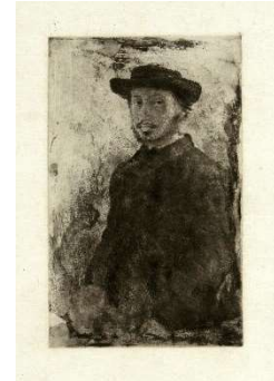
Edgar Degas Edgar Degas, par lui-même. 1857 Etching and drypoint, monotype col- oured. 44,8 x 31,4 cm, sheet