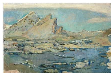
Ferdinand Hodler Gemmi-Landschaft. Circa 1890 Oil on canvas. 67,5 x 104 cm Estimate CHF 750'000.-

Rarities from international prints enrich all the catalogues. We have already mentioned the rarities from the works of Edgar Degas (with estimates ranging from CHF 10'000 to 475'000). Even one sheet of Goya's lithographs «Los Toros de Burdeos» is considered an essential enrichment of an auction, the complete set of the four bullfight scenes and in such beautiful condition comes only very rarely on the market (estimate CHF 500'000.-). Also offered by Goya is a complete «Los Caprichos» in the first edition of 1799 (estimate CHF 150'000.-). Also extremely rare is Vincent van Gogh's additionally charcoal-worked etching «L'homme à la pipe - Portrait Docteur Gachet», a print made personally by van Gogh shortly before his untimely death.