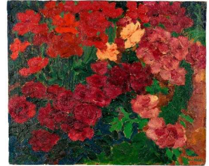
Emil Nolde Mohn und Rosen. 1917 Oil on canvas. 73,3 x 88,3 cm