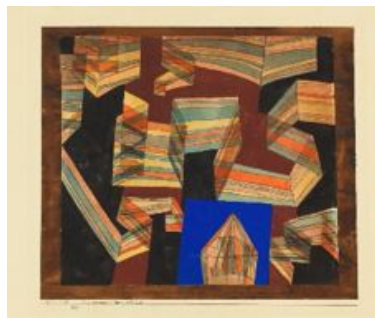
Paul Klee Transparent-perspektivisch. 1921 Watercolour. 39,4 x 48,2 cm, Karton Estimate CHF 500'000.-