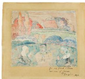
Paul Gauguin L'Angelus en Bretagne. 1894 Monotype in colours.. 27,5 x 30 cm