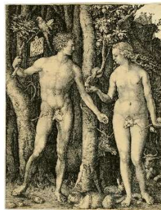
Albrecht Dürer Adam und Eva. Um 1504 Engraving. 25,4 x 19,5 cm, sheet Estimate CHF 400'000.-