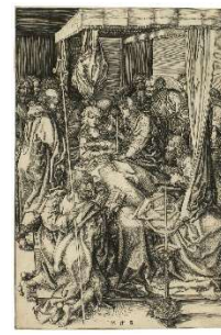
Martin Schongauer Der Tod Marias, umgeben von 12 Aposteln 1470/1473. Engraving 25,7 x 17,1 cm, sheet Estimate CHF 250'000.-

In order to further meet the trend towards a better digital offer, we will again offer a selection of artworks online in our «Online Only» auction. The works are, of course, just as carefully described as in the printed catalogues of our live auctions; however, you will now find detailed photographs, detailed descriptions and the opportunity to bid exclusively in our online catalogue on our website www.kornfeld.ch .