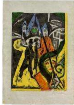
Ernst Ludwig Kirchner Kokotte auf der Strasse – Tauenzienstrasse in Berlin. 1915. Coloured woodcut, 46,5 x 24,7 cm, sheet size Estimate CHF 225'000.-