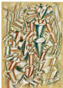
Fernand Léger Personnages dans und escalier. 1914 Watercolour. 23,6 x 30,4 cm Estimate CHF 800'000.-