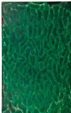
Sam Francis Green. 1952 Oil on canvas, 148 x 93,5 cm

The capital painting «Green» by Sam Francis, offered with an estimate of CHF 2 million, is the main lot from the field of post-war and contemporary art. It is being brought back to the market for the first time since its initial purchase in the 1950s. Alberto Giacometti's very personal bronze of his brother Diego, «Buste d'Homme (New York II) », with an estimate of CHF 1.5 million, or the wonderfully preserved green "Concetto spaziale, Attese" by Lucio Fontana (estimate CHF 700,000) should also be mentioned.