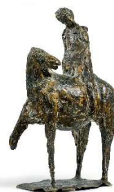
Marino Marini Piccolo cavaliere. 1948 Bronze. 50 x 20 x 25 cm Estimate CHF 175'000.-

Swiss art is particularly well represented this year. There are 22 oil paintings and works on paper by Ferdinand Hodler, with the early and very impressive «Gemmi-Landschaft» from around 1890 (estimate CHF 750,000). As many as 43 works are by Cuno Amiet. The fact that just four of the rare and beautiful winter landscapes (all painted between 1903 and 1916, with estimates ranging from CHF 300'000 to 500'000) have come together is a minor sensation. There are 24 works by Giovanni Giacometti on offer, ranging from the early, almost pointillist «Autunno – Bergdorf mit Schafen» from 1900 (estimate CHF 600'000.-) to the early, rare woodcuts.