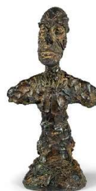
Alberto Giacometti Buste d'Homme (New York II), 1965 Bronze, cast 1972 46,5 cm hoch, 24,5 x 15,1 cm Estimate CHF 1'500'000.-