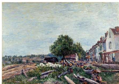
Alfred Sisley Chantier à Saint-Mammès. 1880 Oil on canvas. 65 x 92 cm