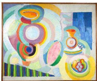
Robert Delaunay Nature morte portugaise. 1916 Oil on canvas. 171 x 211 cm Estimate CHF 2'500'000.-

Modernism is particularly well represented this year. From France, the monumental still life by Robert Delaunay (estimate CHF 2.5 million) and the two outstanding cubist works by Georges Braque (estimate CHF 1.6 million) and Fernand Léger (CHF 800'000), both from 1913/1914, stand out.