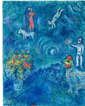
Marc Chagall La fête au village. 1980-1982 Oil on canvas. 80,7 x 64,8 cm Estimate CHF 800'000.-