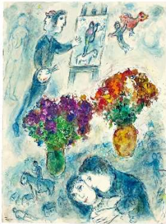
Marc Chagall Les amoureux aux deux bouquets et le peintre Circa 1975. Gouache. 76,4 x 56,6 cm Estimate CHF 275'000.-

The special catalogue «Marc Chagall - Works on Paper» offers 40 works on paper from the Chagall family estate, with estimates ranging from CHF 50'000 to 300'000. The main catalogue also includes three paintings by the master, notably «La fête au village» (estimate CHF 800'000.-).