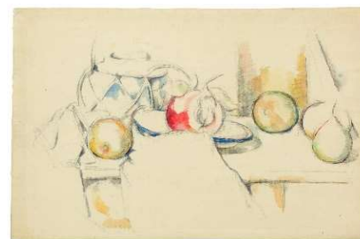
Paul Cézanne Pot à gingembre avec fruits et nappe. 1888/90 Watercolour over preliminary drawing in pencil. 31,6 x 48,5 cm Estimate CHF 1'250'000.-