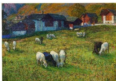
Giovanni Giacometti Autunno – Bergdorf mit Schafen. 1900 Oil on canvas. 76 x 111 cm Estimate CHF 600'000.-

Swiss art is particularly well represented this year. There are 22 oil paintings and works on paper by Ferdinand Hodler, with the early and very impressive «Gemmi-Landschaft» from around 1890 (estimate CHF 750,000). As many as 43 works are by Cuno Amiet. The fact that just four of the rare and beautiful winter landscapes (all painted between 1903 and 1916, with estimates ranging from CHF 300'000 to 500'000) have come together is a minor sensation. There are 24 works by Giovanni Giacometti on offer, ranging from the early, almost pointillist «Autunno – Bergdorf mit Schafen» from 1900 (estimate CHF 600'000.-) to the early, rare woodcuts.