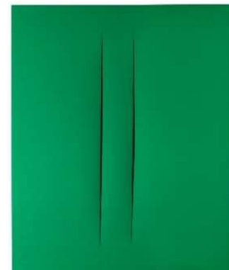
Lucio Fontana Concetto spaziale, Attese. 1964/1965 Dispersion paint on canvas. 60,6 x 50 cm