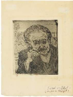
Vincent van Gogh L'homme à la pipe – Portrait Docteur Gachet. 15. Juni 1890 Etching, reworked in black charcoal, 31 x 23,5 cm, sheet