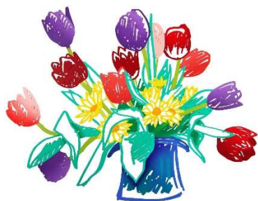
Tom Wesselmann Birthday Bouquet Edition (Hat Vase). 1988/91 Alkyd on steel, 106,6 x 138,5 cm Estimate CHF 75'000.-

The large-format painting «Composition abstraite» by Serge Poliakoff was created at the height of his creative powers. In a rare large format, the paint additionally mixed with sand to create a velvety surface, the painting is expected to fetch CHF 750'000. Just two metal «Cut-Outs» by Tom Wesselmann or another bronze with unique character by Marino Marini, «Piccolo cavaliere», of which we already had the pleasure to offer a version last year, can be found in the catalogues.