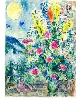
Marc Chagall Bouquet au paysage d'hiver. 1971 Gouache, pastel. 76,8 x 57 cm Estimate CHF 300'000.-

The capital painting «Green» by Sam Francis, offered with an estimate of CHF 2 million, is the main lot from the field of post-war and contemporary art. It is being brought back to the market for the first time since its initial purchase in the 1950s. Alberto Giacometti's very personal bronze of his brother Diego, «Buste d'Homme (New York II) », with an estimate of CHF 1.5 million, or the wonderfully preserved green "Concetto spaziale, Attese" by Lucio Fontana (estimate CHF 700,000) should also be mentioned.