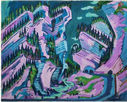
Ernst Ludwig Kirchner Zügenstrasse. 1922-1924 Oil on canvas. 125 x 150 cm