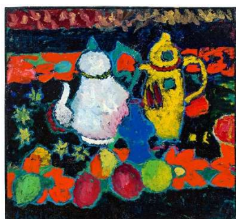
Alexej von Jawlensky Stillleben mit gelber und weisser Kanne. 1908. Oil on cardboard. 49,6 x 53,8 cm Estimate CHF 1'000'000.-

Paul Klee is represented in the catalogues with 11 original works from all creative phases. For the first time, two of the rare «Sonderklasseblätter» will be offered, such as the wonderfully freshly coloured «Transparent-perspektivisch» from 1921 (estimate CHF 500'000). Among his artist friends, the early, expressive still life by Alexej von Jawlensky (estimate CHF 1 million) and Lyonel Feininger's late, atmospheric lake piece (estimate CHF 350'000) are worth mentioning.