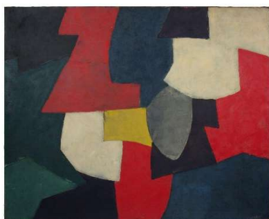
Serge Poliakoff Composition abstraite. 1959 Oil and sand on canvas. 129,5 x 162 cm Estimate CHF 750'000.-