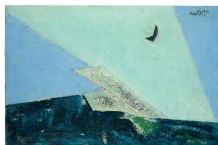
Lyonel Feininger Wellenkamm und Gegenbild – Crest and Images. 1952. Oil on canvas. 51 x 77 cm Estimate CHF 350'000.-

In the field of German Modernism, two capital oil paintings from Ernst Ludwig Kirchner's period from Davos (both with an estimate of CHF 750,000) continue to be offered. Emil Nolde's absolutely stunning painting «Poppies and Roses» is proclaimed, free of any claims (after an amicable solution with the heirs of the Jewish previous owners) with an estimate of CHF 1 million. Special mention should also be made of absolute rarities from Kirchner's graphic works, such as two sheets from «Peter Schlehilhs wundersame Geschichte» or the monotype-like coloured woodcut «Kokotte auf der Straße» from 1915 (estimates CHF 125'000-225'000).