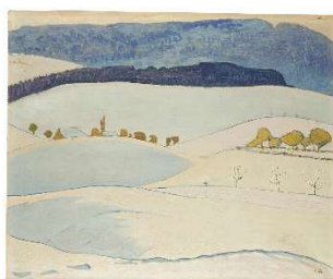
Cuno Amiet Winterlandschaft. 1908 Oil on canvas. 54 x 64,5 cm Estimate CHF 400'000.-